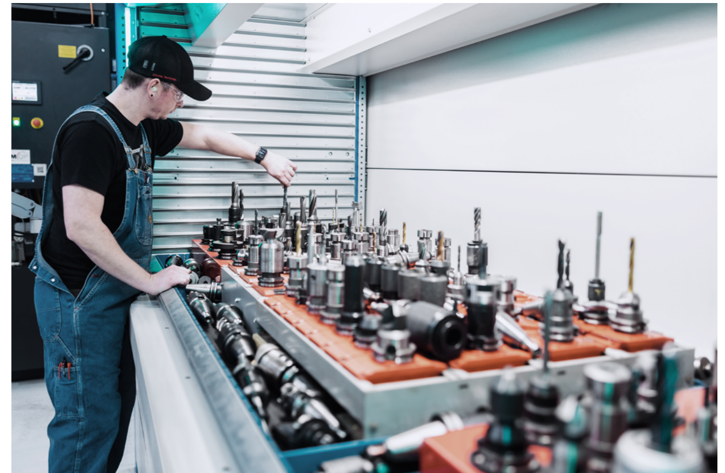
Tool storage with Kardex Shuttles

Further options and storage environments with air conditioning, clean room, fire protection or esd versions are available.