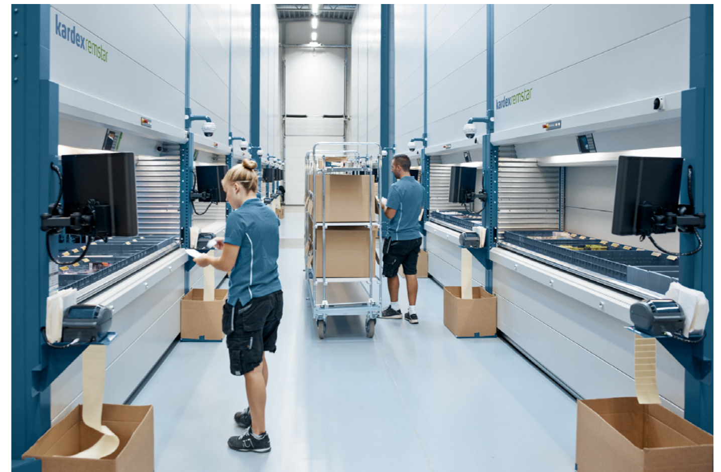
Order picking with Kardex Shuttles