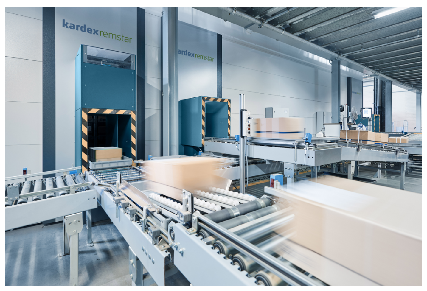
Order consolidation with automatic conveyor connection