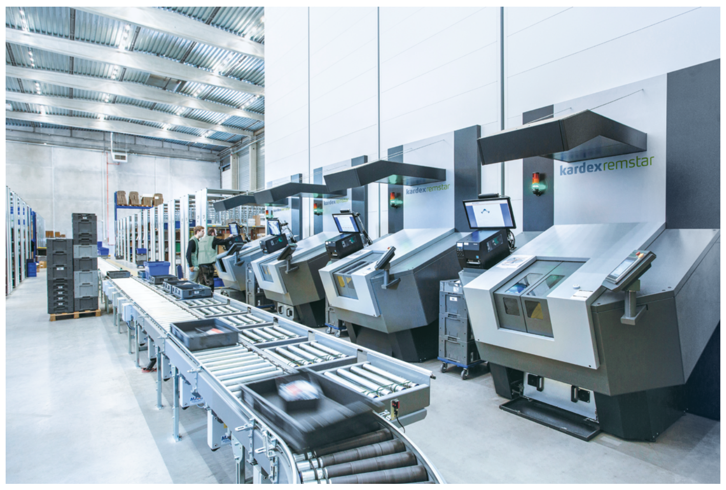
Order picking with turntables and a conveyor system with put locations

Further options and storage environments with air conditioning, fire protection or esd versions are available.